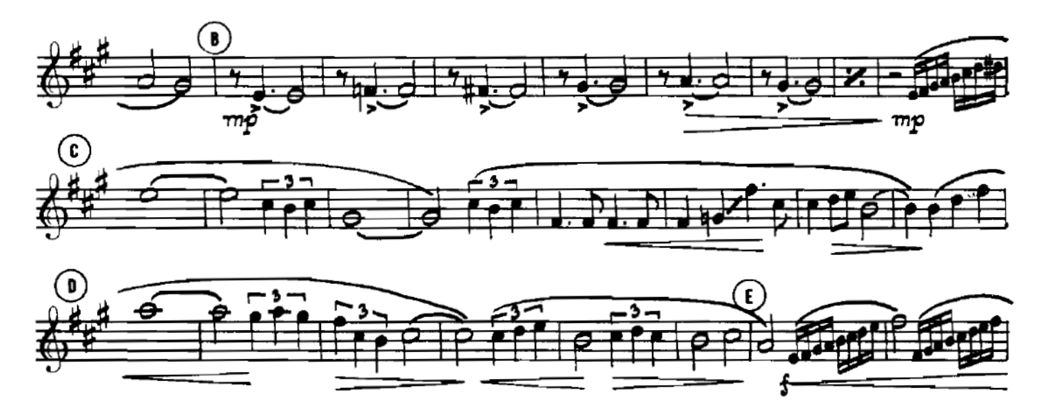
#3 – BEGUINE FOR BAND, RECORD LETTER J TO LETTER N (MM=132):

#2 BEGUINE FOR BAND, RECORD one bar before letter C to two after letter E (MM=132):